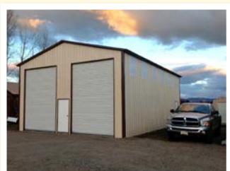
GARAGE BUILDINGS & WORKSHOPS